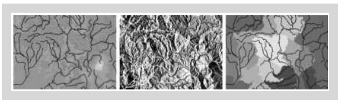
Figure 2. Given the Digital Terrain Model, GRASS can identify automatically river basins with a single command (i.e. r.watershed).